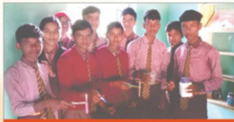
Laboratory: Practical Hours