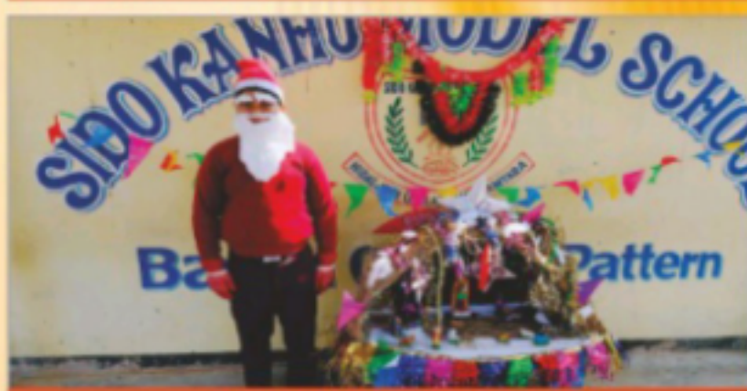
Gracious Presence of Santa