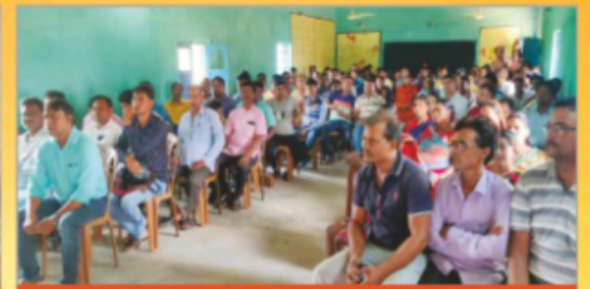
Parent Teacher Meeting