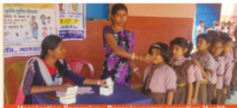
Vaccination Campaign : Consciousness regarding Health and Hygiene