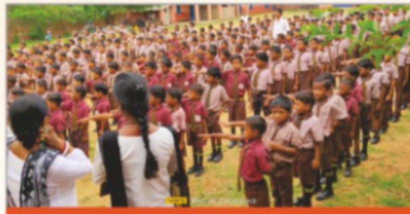
Pledge for Nationalism