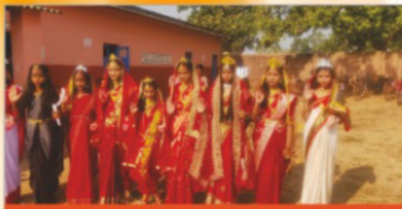
Beti Bachao Beti Padhao Campaign