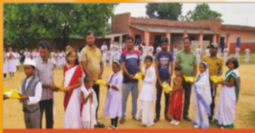
Showcase of Unity in Diversity