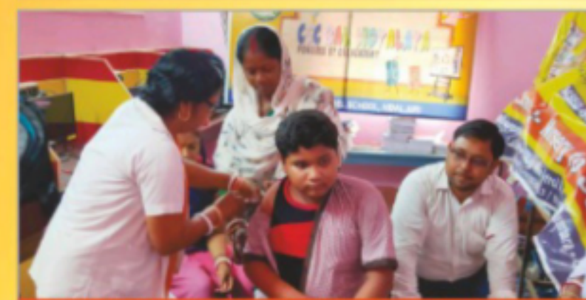
Rubella Vaccination