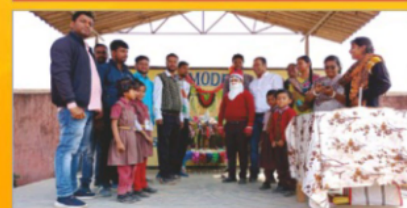
SKMS Family in Aframe