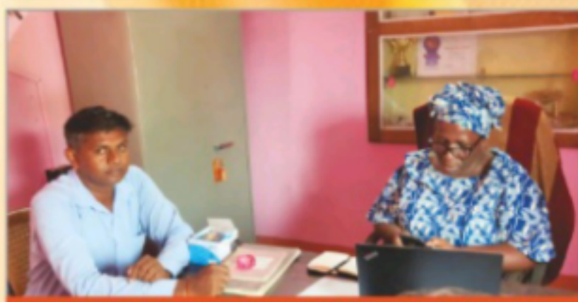
Health Awareness Meet With Nigerian Deligait