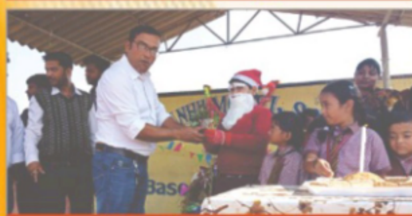
Encouraging Cultural Ethnicity

Printed by : Dev Printers, Dumka Mob. : 9939565285