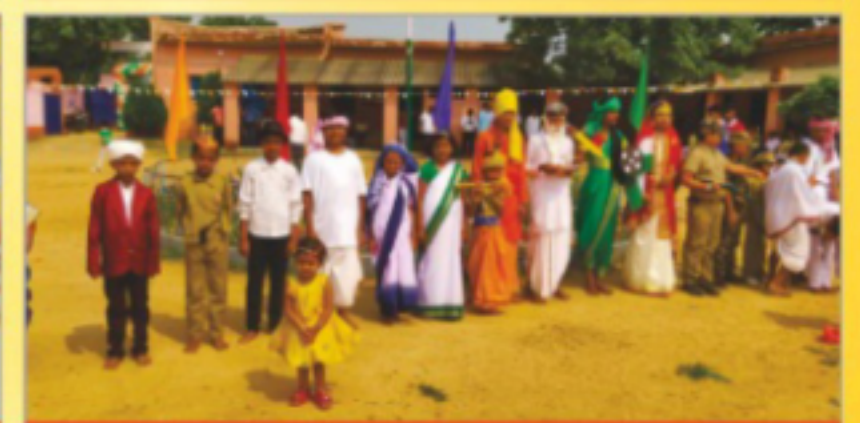
Glimpse of Independence Celebration