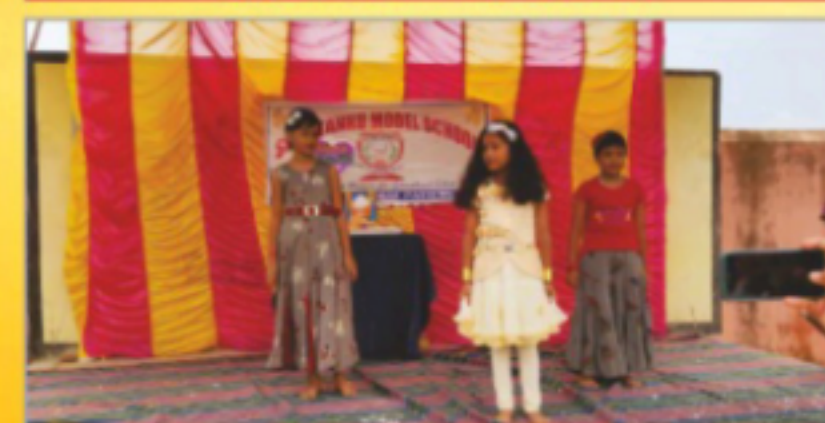
Act by Tiny Tots